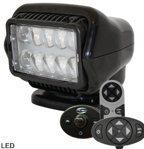
Stryker LED Light Beam Dimensions