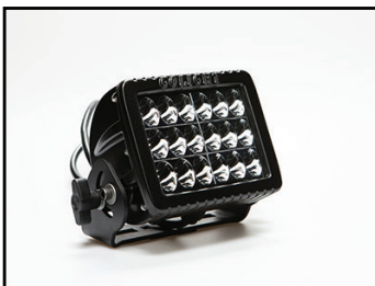
GXL PERFORMANCE LED Floodlight 4421 (Black)

Package Includes: Mounting Hardware Rockguard