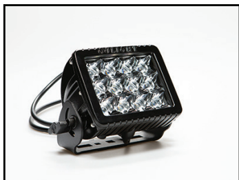
GXL PERFORMANCE LED Spotlight 4411 (Black)

Package Includes: Mounting Hardware Rockguard