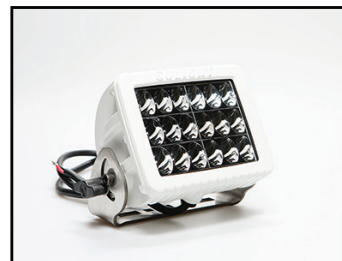
GXL PERFORMANCE LED Marine Grade Floodlight 4422 (White)

Package Includes: Mounting Hardware Rockguard