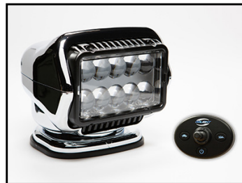
STRYKER LED 30204 (White) 30214 (Black) 30264 (Chrome)

Package Includes: Wireless Handheld Remote Stainless Steel Mounting Bracket