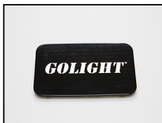
LED Snap On Rockguard 15309 - White 15310 - Black