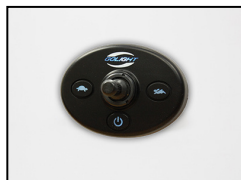
Hardwired Joystick Dash Remote 3020-D