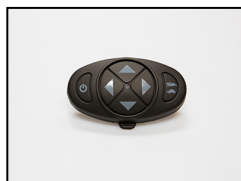
Wireless Dash Mount Remote 30200