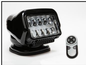
STRYKER LED 30004 (White) 30514 (Black) 30064 (Chrome)

Package Includes: Wireless Handheld Remote Stainless Steel Mounting Bracket