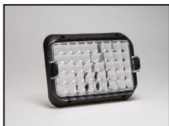
Snap On LED Flood Lens 15420