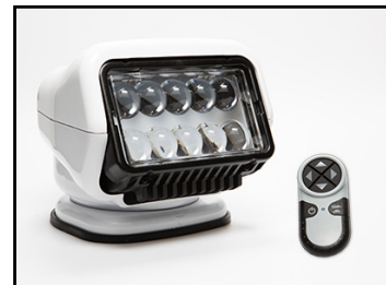
STRYKER LED 30005 (White) 30515 (Black) 30065 (Chrome)

Package Includes: Wireless Handheld Remote Attached Magnetic Base 15' Power Cord w/ Cig Plug