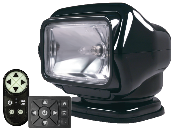
Halogen Light Beam Dimensions